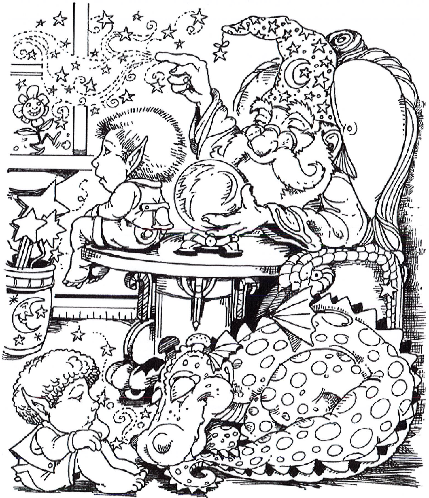
1. Mushroom, 2. Cup, 3. Sock, 4. Umbrella, 5. Candy cane, 6. Bell, 7. Pencil, 8. Ruler, 9. Wishbone, 10. Whale, 11. Worm, 12. Heart, 13. Watch.